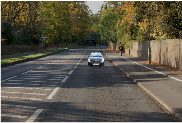
Fig. 1. Example frame from a stimulus used to test thresholds for detecting looming in foveal vision. Each stimulus consisted of a 0.2-s presentation of a photo-realistic image of a car against a contextual road-scene background. For the extrafoveal conditions, the car image was presented at 4.25^\circ eccentricity from the center of the screen.

while allowing for a t_c of 5 s. In a natural setting, any sampling of the scene prior to this time would have had a lower rate of looming than that presented. In the simpler extrafoveal condition (isotropic expansion), the same stimuli were presented extrafoveally by positioning the car image 4.25^\circ from the central fixation point in one of four quadrants. Extrafoveal stimuli would occur in natural scenes if pedestrians did not fixate directly on a vehicle when visually scanning a cluttered street environment. For foveal stimuli, participants viewed the screen monocularly from a distance of 4 m so that the number of pixels per degree would be maximized, whereas for extrafoveal stimuli, they viewed the screen monocularly from 2 m to allow for the angular displacement. Images were automatically rescaled according to the viewing distance in order to ensure that visual angles were equivalent to those that would be experienced at the roadside.